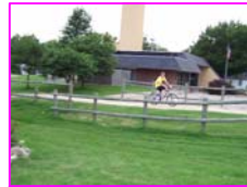
3131 Anderson Ave. Trail Head *