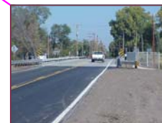
S. Manhattan Ave. Trail Head *