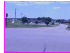
Casement Rd./Hayes Rd. Trail Head *