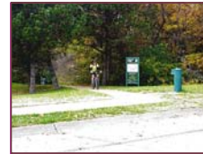
Richards Drive Access Point