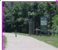
Pecan Circle Access Point