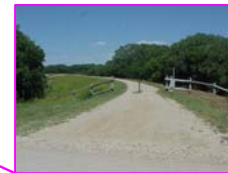
Temple Lane Access Point