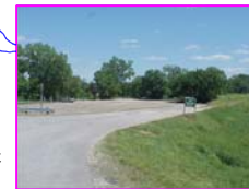
US 24/Blue River Trail Head *