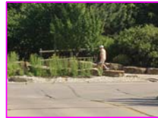
Kimball Ave./Hudson Ave. Access Point